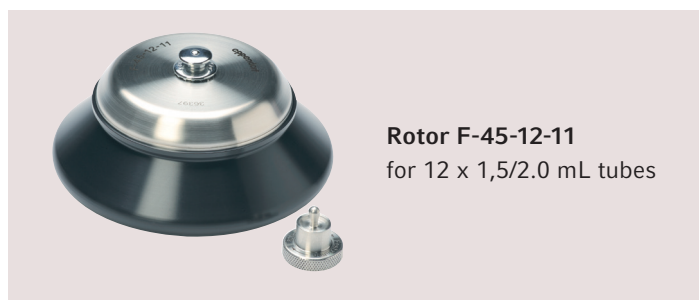
Rotor F-45-12-11 for 12 x 1,5/2.0 mL tubes