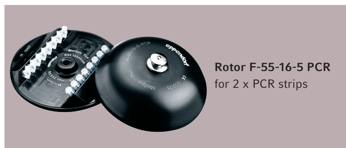
Rotor F-55-16-5 PCR for 2 x PCR strips